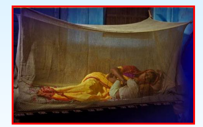
Fig 7: Pregnant mother and child using Insecticide treated net while sleeping

Promotion of use of Insecticide Treated Nets (ITNs) - ASHA would be involved in identification of people living below the poverty line for distribution of free ITNs. ASHA would also be trained for retreatment of community owned ITNs and would educate the community to do the same. In particular, ASHA would also encourage pregnant mothers and children under five to use ITNs.