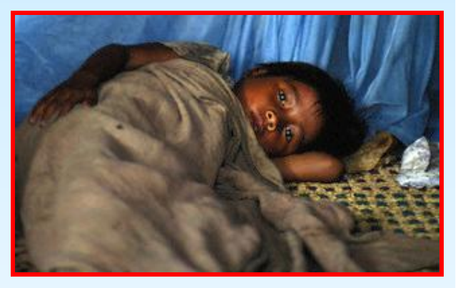
Fig 5: Patient showing symptoms of malaria

The fever is usually accompanied with fever spikes (sudden rise and fall in temperature), chills and rigors followed by sweating.