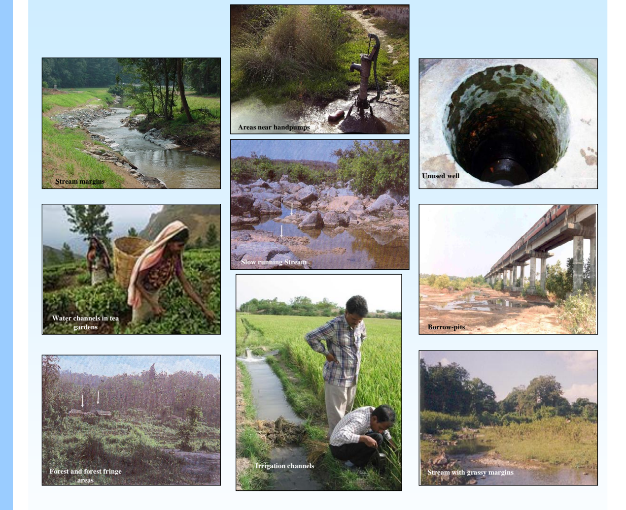
Fig 3: Potential Breeding Sites for Anopheles mosquitoes

Anopheles sundaicus - Breeds in brackish (slightly salty) water pools with algae, margins of mangroves, lagoons and swamps. Malaria vector in Andaman and Nicobar islands.